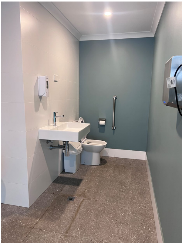
Change Room Male Error! Bookmark not defined.