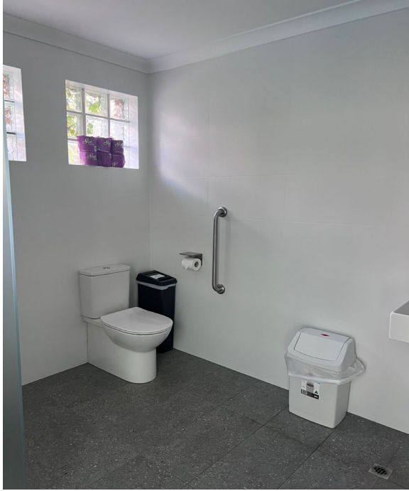
Change Room Female Error! Bookmark not defined.