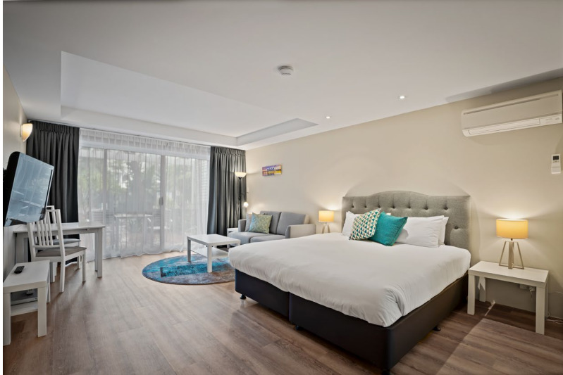
Resort Room Hero - Copy Error! Bookmark not defined.