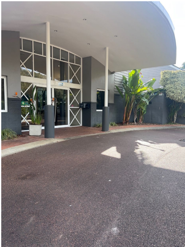
Resort Reception Error! Bookmark not defined.