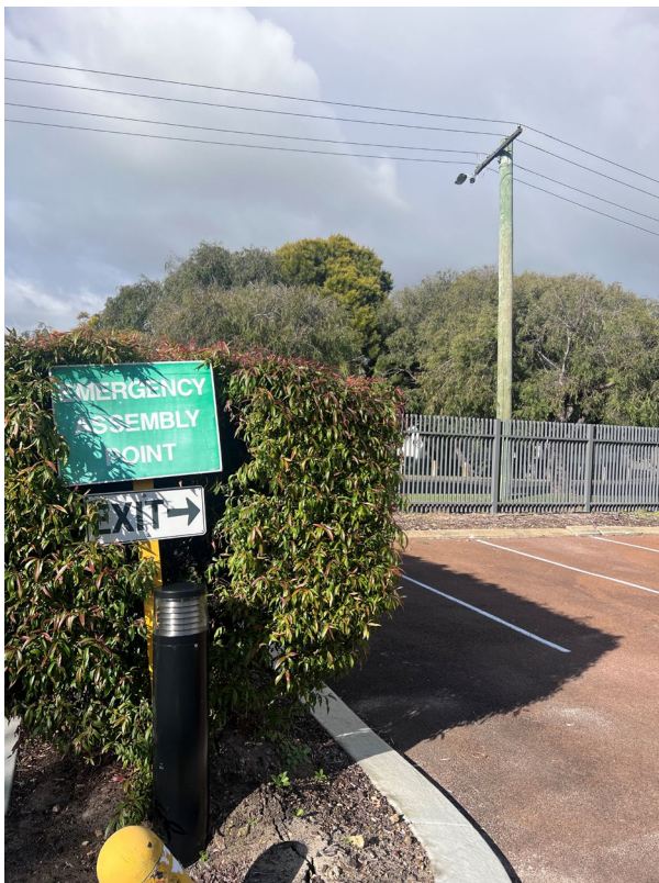
Emergency Assemble Point Error! Bookmark not defined.