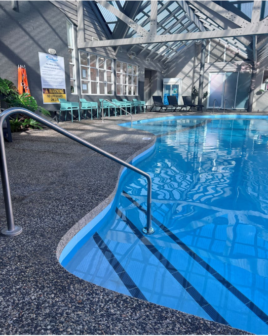
Pool Entry with rail