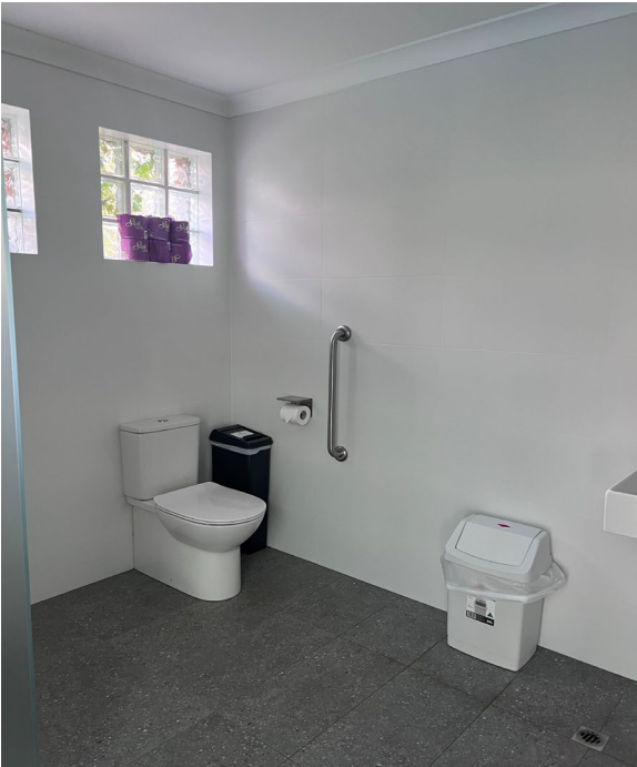
Change Room Female