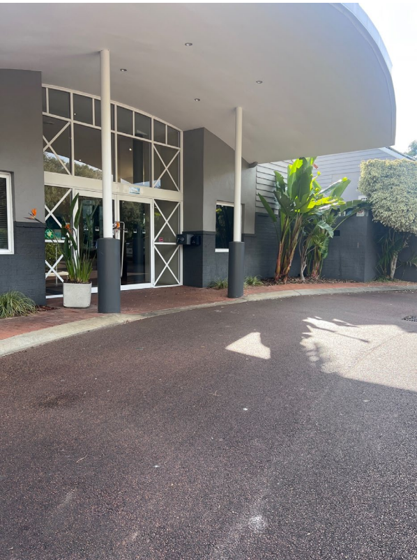
Resort Reception Arrival