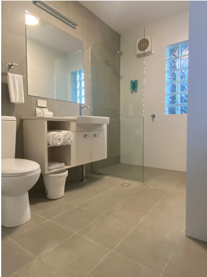
Resort Room Walk-in Shower Bathroom